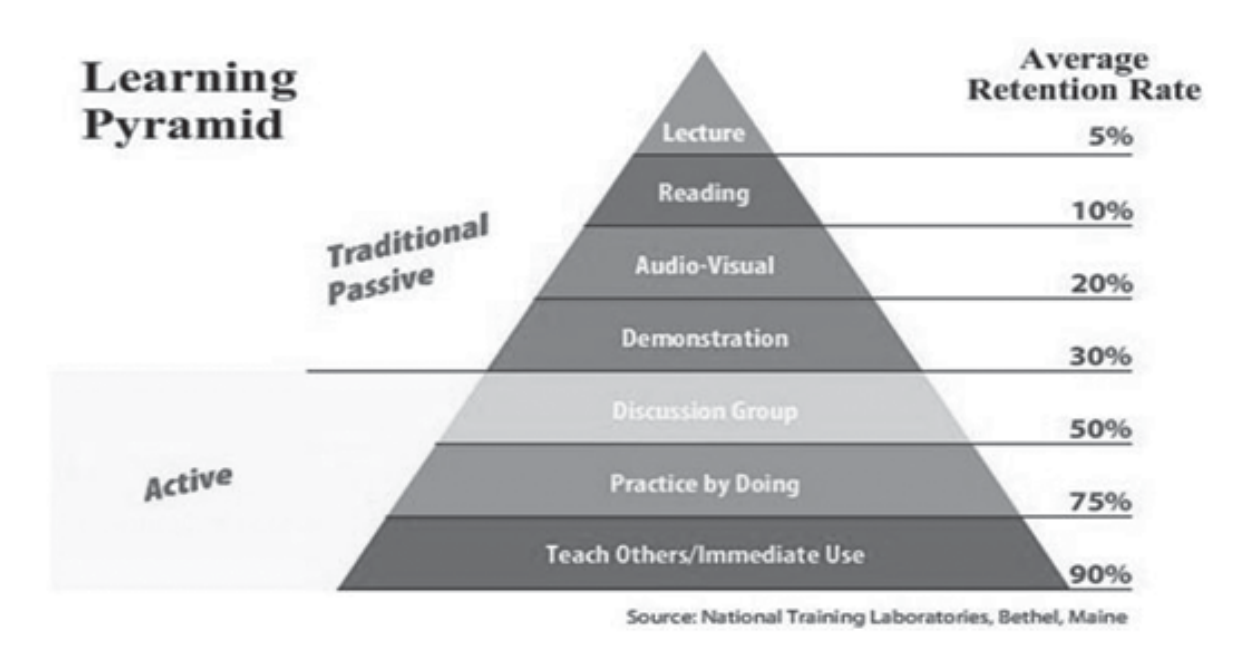
Fig.2: Learning Pyramid by Dale

with earlier analogue equipments. Second, computers can easily transform information from one symbol system to another.